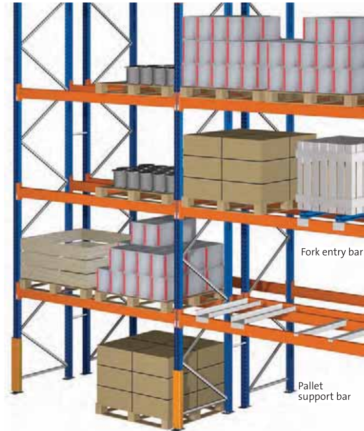
Fork entry bar