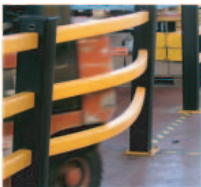
Standard Pedestrian Barrier

All post sections are 110 x 110mm, upper rail sections are 75 x 50mm and lower rail section is 166mm OD.