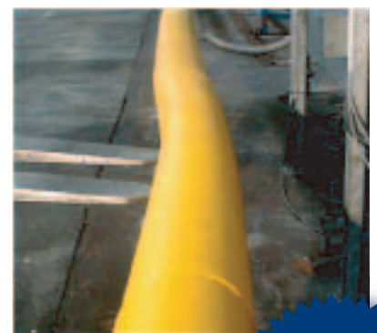
Standard Traffic Barrier

THERE IS NO SPACE TOO BIG TOO SMALL OR TOO AWKWARD!