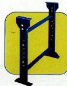
adjustable height stands