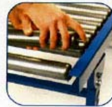
spring loaded rollers