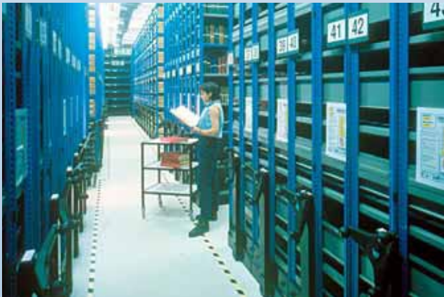
QB2 on mobile bases in a County Records Office.