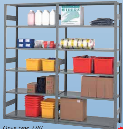
Open type, QBL.

Designed and manufactured to the highest specification, QBL meets all the standards promoted by the Storage Equipment Manufacturers Association Code of Practice for Static & Mobile Shelving.