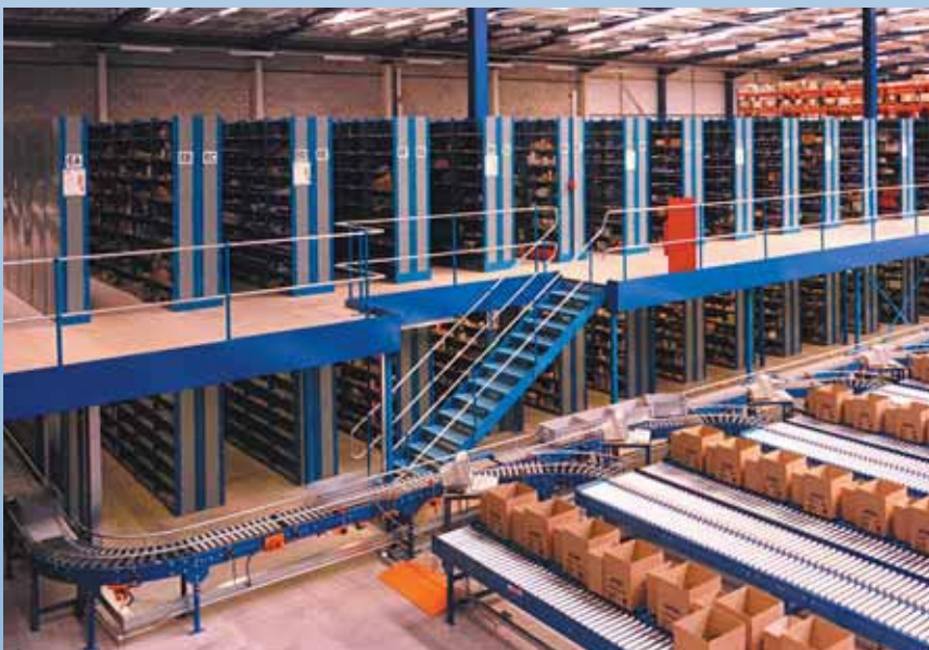
A QB2 multi-tier installation in an Engineering Distribution Centre.