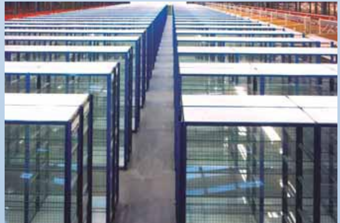
Single-tier QB2 in a Pharmaceutical Distribution Centre.