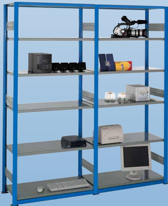
Open type QB2 starter and extension bay.