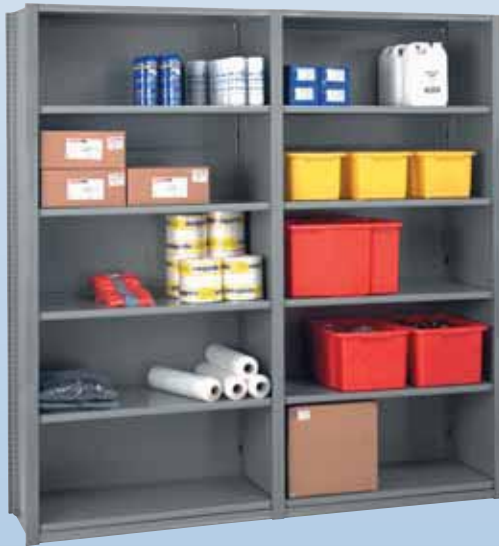
QBL with rear cladding and clad ends.

Meeting the needs of industry and commerce, QBL is, the Light Heavyweight solution.