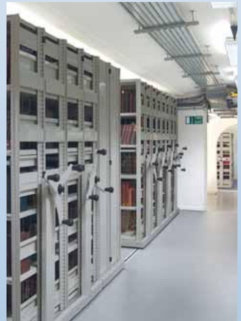
QBL on mobile bases in an Archive Repository.

The essential features of a storage system are: