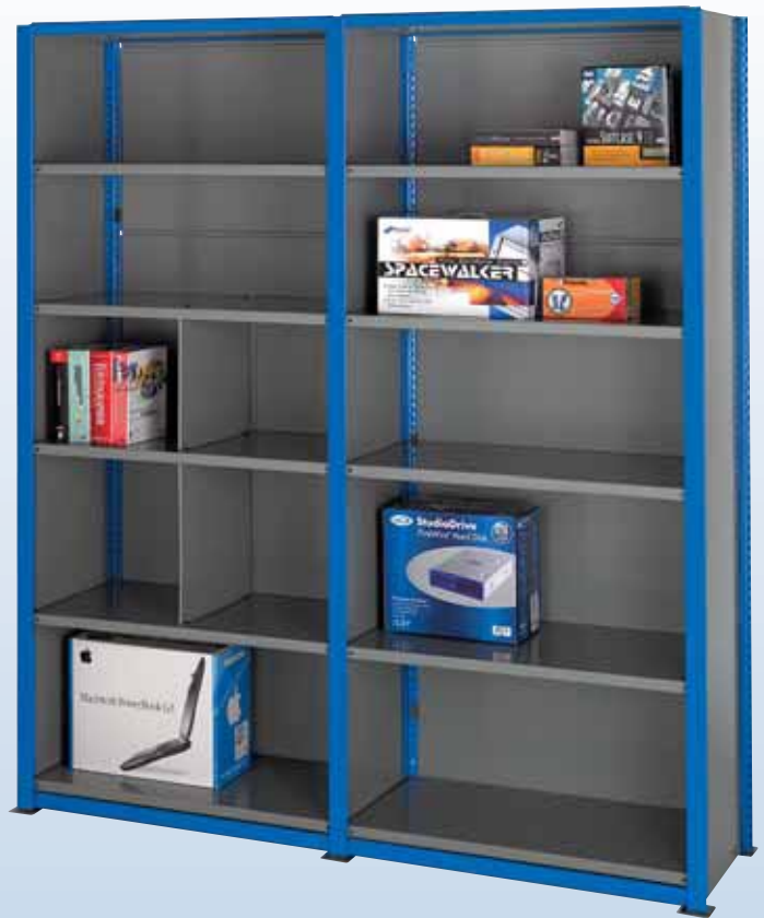
QB2 starter and extension bay with rear cladding and clad ends.