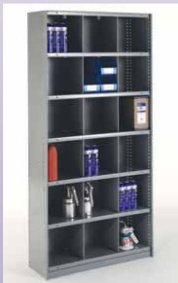
Rolled edge bin unit with 6 x 3 compartments