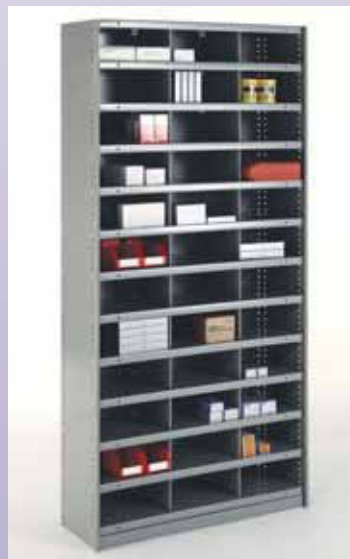
Rolled edge bin unit with 12 x 3 compartments