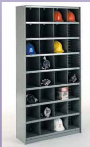
Rolled edge bin unit with 8 x 4 compartments