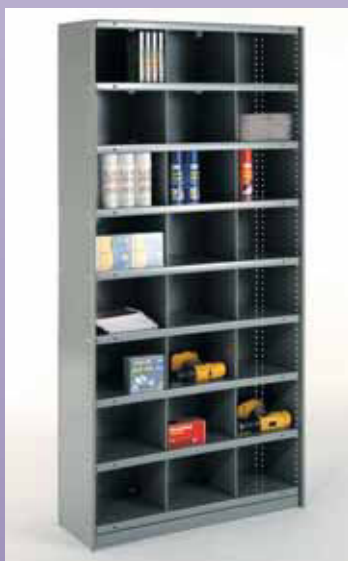
Rolled edge bin unit with 8 x 3 compartments