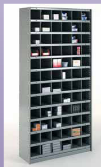
Rolled edge bin unit with 12 x 6 compartments