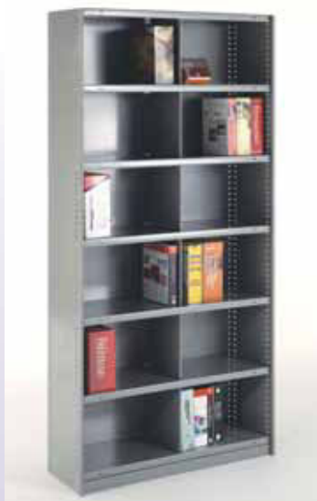
Rolled edge bin unit with 6 x 2 compartments