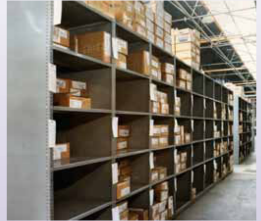
Metabolt storing boxed items in a distribution warehouse.

M ETABOLT adjustable shelving, based on the original BS826:1955 specification has remained one of the most popular shelving systems since it's conception. The benefits of a robust construction and adaptability combine together in a flexible system created to address the needs of industrial and commercial storage. Simple runs of Metabolt can be easily extended and enhanced with a wide range of accessories. Complex single and multi-tiered installations can be designed to maximise the available space of even the most awkward shaped buildings, whilst Metabolt on mobile bases offers maximum space utilisation and selectivity.