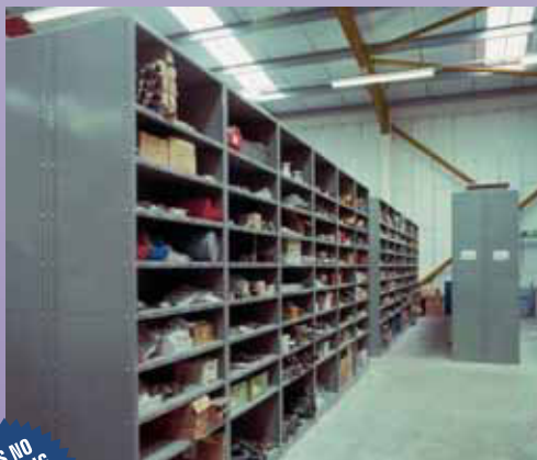
Closed type shelving in an engineering stores.

THERE IS NO SPACE TOO BIG TOO SMALL OR TOO AWKWARD!