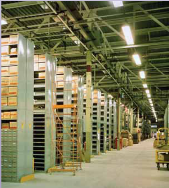
High bay shelving in the automotive industry.