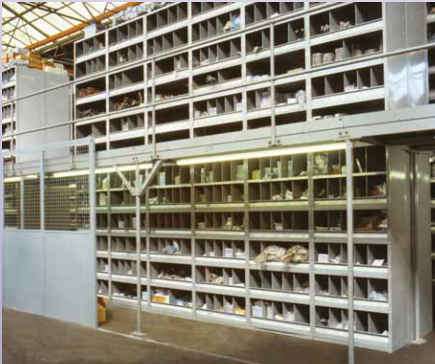
Two-tier shelving with a gantry walkway for access to the upper level.

Typically, the walkways would be either expanded steel or a wood derivative with steel stairs to access the second level. Lighting would be suspended below the floor to illuminate the lower level and smoke/fire detectors would also be fitted.