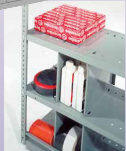
Accessories: dividers and bin fronts.