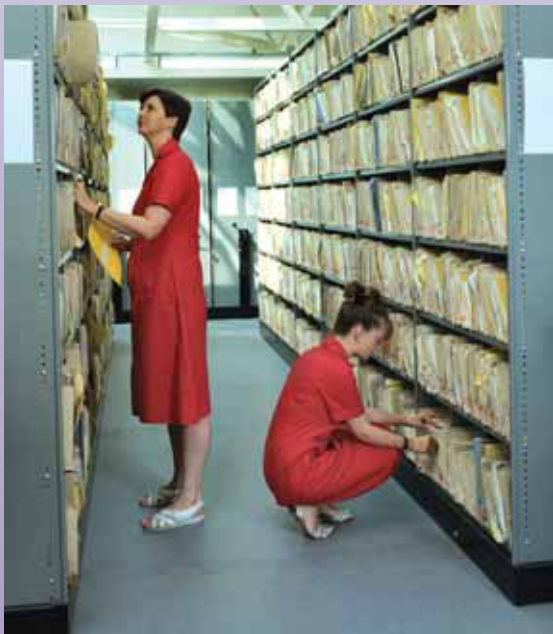
Static, single tier shelving storing Medical Records.

Doctor's surgeries, health centres, hospitals as well as commercial and museum archives can all benefit from the flexible and cost-effect solutions provided by choosing Metaclip shelving.