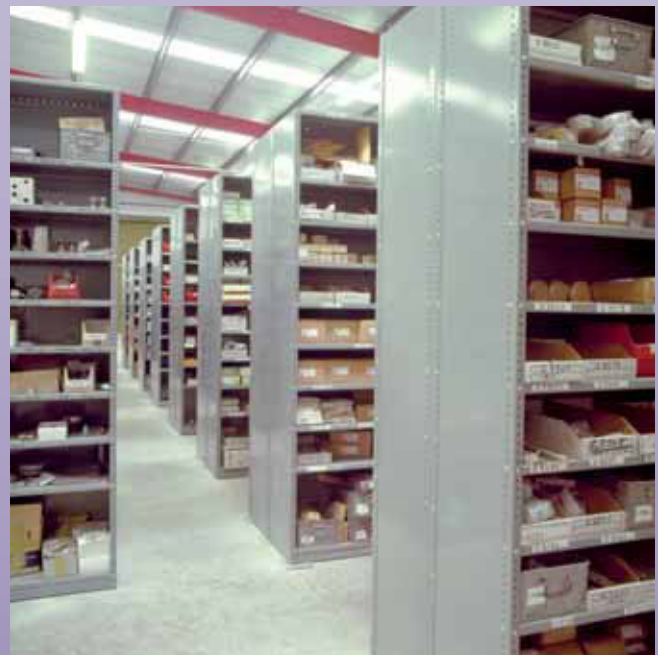
Single tier Metabolt shelving storing components and fixings.