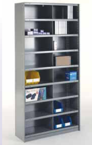
Rolled edge bin unit with 8 x 2 compartments