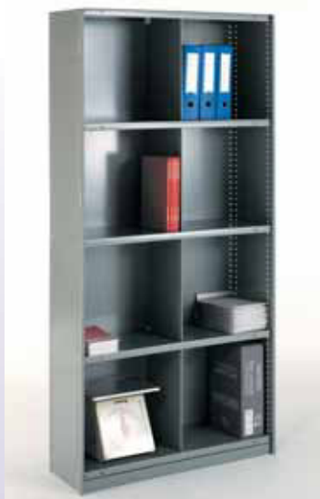
Rolled edge bin unit with 4 x 2 compartments